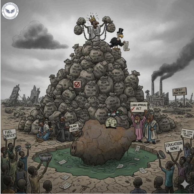
The Great Nigerian Debt Pile-Up: An Assembly Line Production